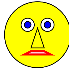
Figure 11-19: A sample widget

>>> from reportlab.lib import colors >>> from reportlab.graphics import shapes >>> from reportlab.graphics import widgetbase >>> from reportlab.graphics import renderPDF >>> d = shapes.Drawing(200, 100) >>> f = widgetbase.Face() >>> f.skinColor = colors.yellow >>> f.mood = "sad" >>> d.add(f) >>> renderPDF.drawToFile(d, 'face.pdf', 'A Face')